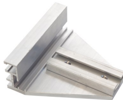
FXTSNZ-SNB-BKT For use with ARB 60mm & 76mm Offset option available