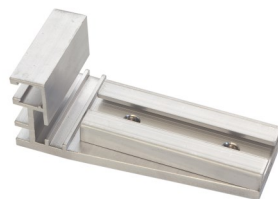
FXTSNZ-SNB-BKT-STD For strapping & bolting to timber post - Offset option available