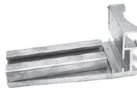
FXTSNZ-SNB-BKT-AUO For use with AUO Bracket