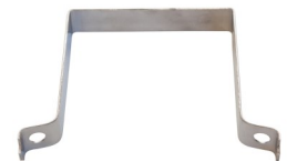
FX LRH Bracket for Post 50x50mm, 100x50mm 95x95mm, 125x75mm 75x75mm, 150x100mm