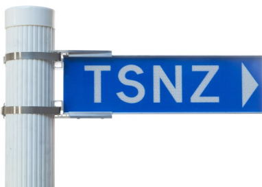
SNB STRAPPING OPTION