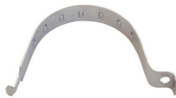
FXARB-060 Bracket for Poles 50mm, 60mm & 76mm, 89mm, 102mm & 114mm