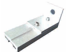
FXTSNZ-SNB-BKT-T100 Timber Post Bracket for bolting to timber post