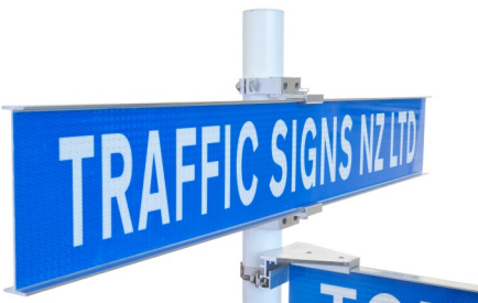
TSNZ SNB COMBINATION