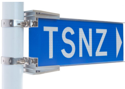
SNB WITH ARB OPTION