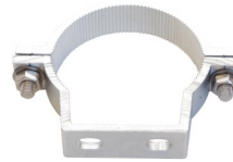
FXAUO Uni Bracket Single or Double Offset 60mm & 76mm